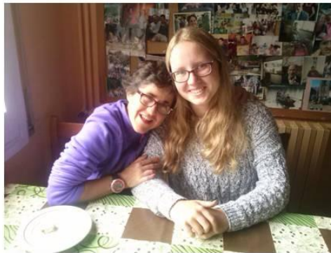
COMUNITAT ELS AVETS - Moià