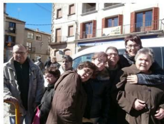
COMUNITAT ELS AVETS - Moià