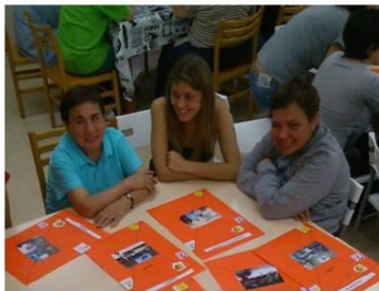
COMUNITAT ELS AVETS - Moià