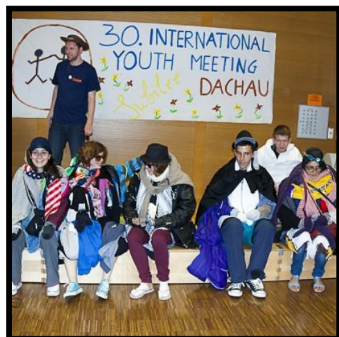
Photo: IYM 2013 in Dachau

Requirements: Being interested in taking part in workshops, working knowledge of English and/or German.