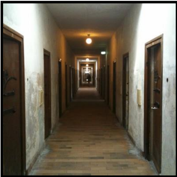
Photo: Inside Dachau

Description: The KZ Dachau was the first concentration camp built by fascist Germany in March 1933. It was also used as an SS training centre. More than 200,000 people from all over Europe were imprisoned here. Many prisoners died as a result of terror, inhuman work, diseases, exhaustion and hunger. The study camp will take place within the framework of the 'International Youth Meeting' (IYM), which