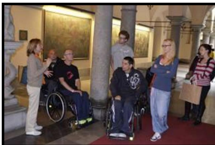
Photo: Participants and volunteers 2013

Description: Our association aims to assist paraplegics and tetraplegics after the end of their rehabilitation and offers them a professional network of activities that enable them to settle down and reintegrate to their local environment. We aim to equip them with tools so they can start independent and active lives. We