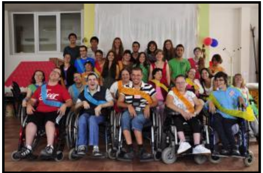
Photo: Participants at Barlicka

Type of Work: The volunteers will organize free time activities for disabled clients of the NGO Barlicka. The centre has been working with people with disabilities for 15 years, trying to help them to live independently. The activities for clients will be organized during the daily summer camp for the clients – summer activities, trips, competitions, games. The volunteers will use the activities of non-formal education to encourage waste separation and energy saving.