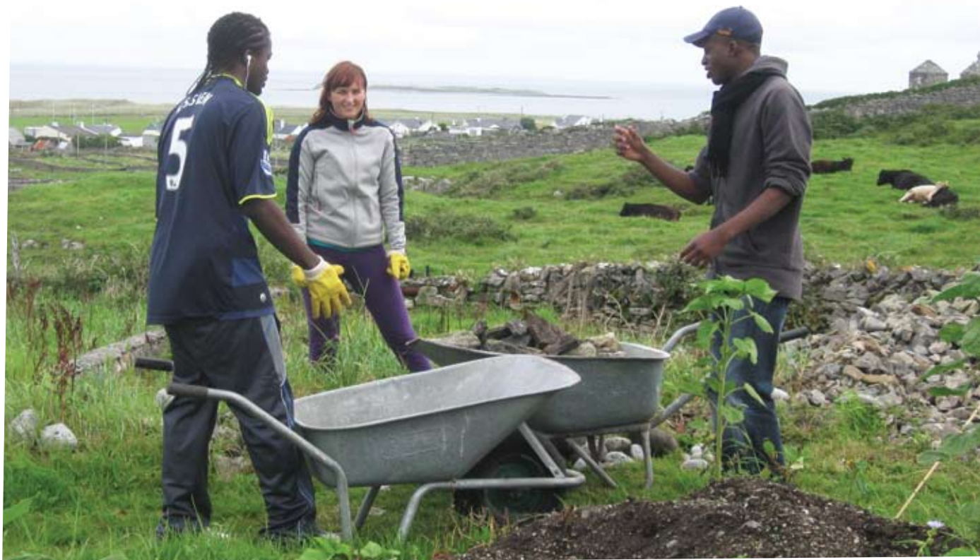
Participants on the Aran Islands permaculture project