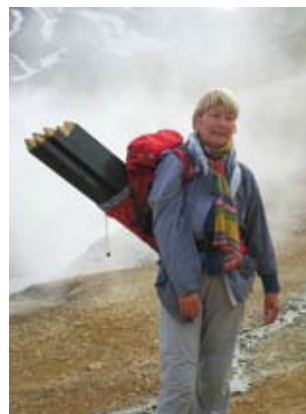
These poles we had to carry to mark a long-distance trail. This area had summer skiing only 15 years ago, now the snow is nearly gone.