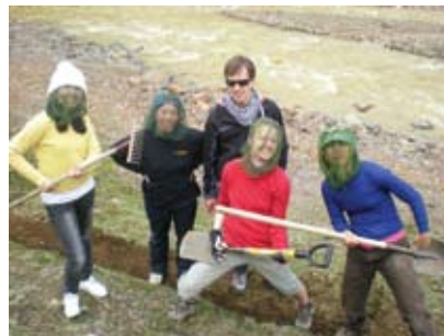
These are my fellow volunteers