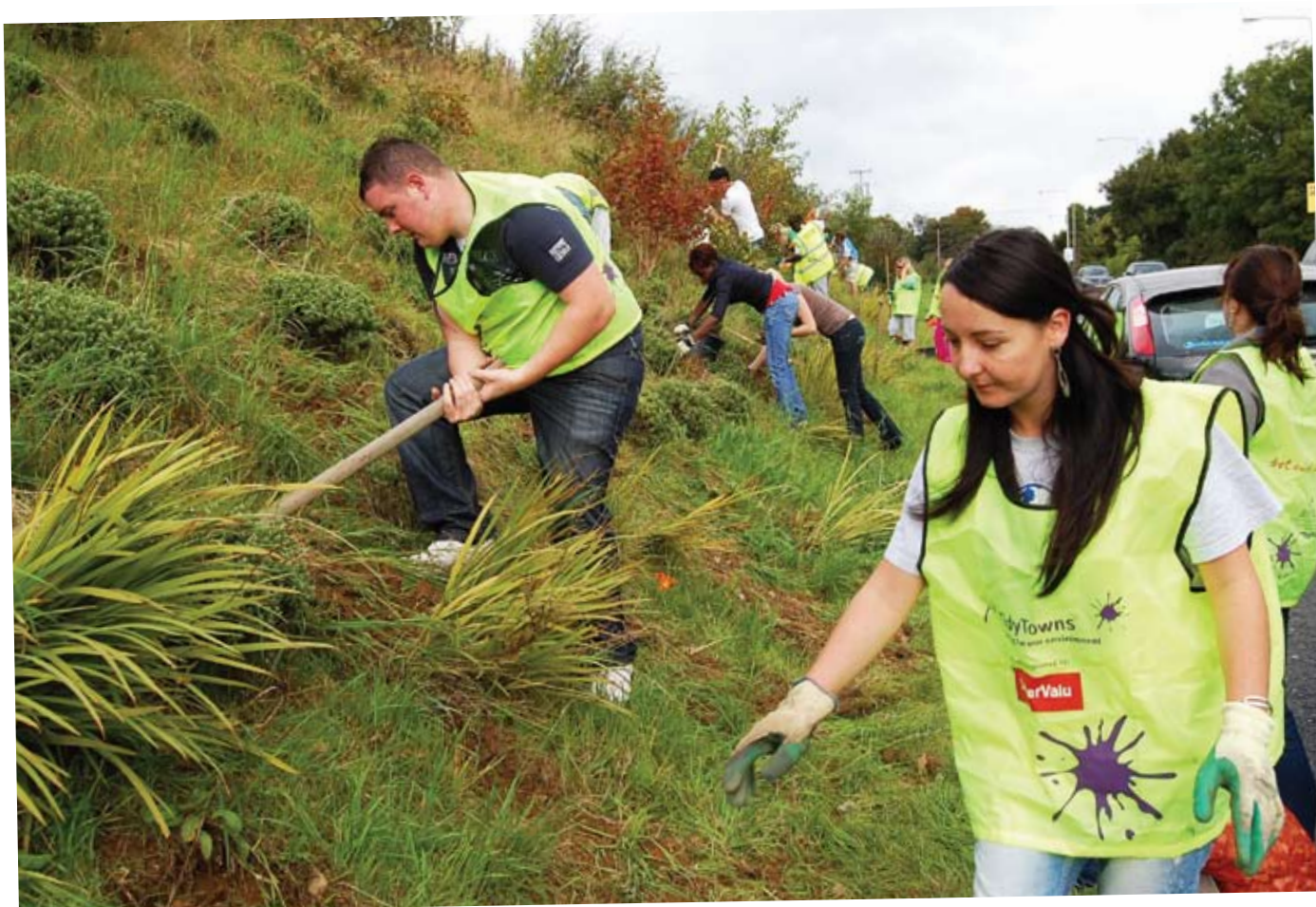
Planting daffodils during the Wicklow Easter Project

In addition to this, YUWG organises training for volunteers and this year they organised training for youth leaders in Genoa, Italy in May. This year, we sent 3 volunteers and 3 trainers to the SCI Youth Leader Training. This 4-day training looked at leadership skills, quality of youth exchanges, and at working with the target group of the Teenage Programme.