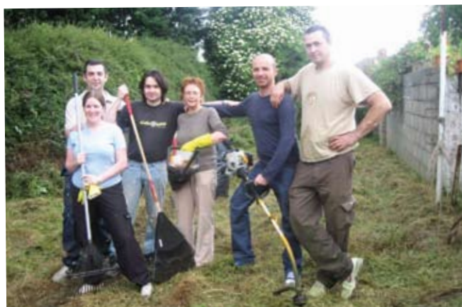
Volunteers from the Dublin Local Group in action

So far this year we have received about 39 requests for assistance. We have assessed 26 and undertaken and completed 7. We noticed quite a big increase in the amount of application for assistance this year compared to last year, and therefore we could not attend to as many jobs as we wanted to. Since we had a good amount of active volunteers on a weekly basis, we decided to focus on slightly bigger