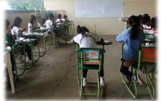
Older boys playing soccer in the schoolyard, The infants class "concentrating"

It was a fantastic experience and I felt like I had achieved something in both places. At the beginning I was a bit nervous but willing to try anything and give everything a fair chance. So I did and it was fantastic; for my confidence, my awareness and my Spanish. No, by the end of July the forest wasn't completely marked out with every specie catalogued and my school kids don't have excellent English, but we marked a good few hectares and identified nearly 1000 trees and the kids met someone from a country they had never even heard of and can sing and mime "Old MacDonald's Farm" with the best of them!